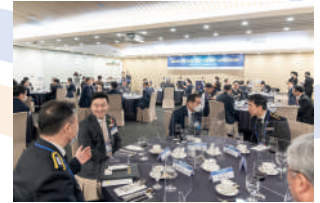
Networking Event for Exhibitors