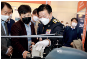
Purchase meeting with Korea Coast Guard Export meeting with overseas buyer & International Coast Guards